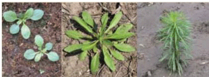
Figure 1. Growth stages of marestail from seedling, rosette, to bolting state.

Marestail tend to be difficult to control even when the plants are small and in the rosette stage, but become even tougher when plants get more than 6 inches tall. That is why fall and early burndown treatments are critical to the long-term management of marestail. Unfortunately, that doesn't always happen. In addition, some marestail have developed glyphosate resistance in many areas. However, some marestail populations are still susceptible to glyphosate, and even resistant plants are not completely immune to glyphosate.