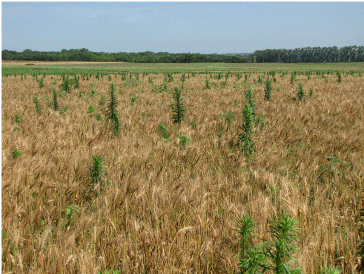
Figure 1. Weeds in wheat near harvest time.

This raises several potential concerns, including harvest difficulties, dockage problems, weed seed production, and soil water depletion. No one wants to spend extra money on a below-average crop, but it may be necessary.