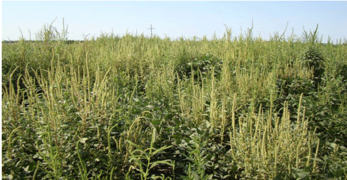
Figure 2. Glyphosate-resistant Palmer amaranth escapes in soybeans.

If preemergence herbicides weren't applied or didn't get activated in a timely manner, early-emerging waterhemp or Palmer amaranth may not have been controlled and can grow rapidly. Flexstar, Cobra, Marvel, and Ultra Blazer can be fairly effective for controlling small pigweed, but are less effective as the pigweed gets larger, especially Palmer amaranth. Some waterhemp and Palmer amaranth also may have developed resistance to this class of herbicides, but size still seems to be a factor, even on resistant populations. These herbicides also provide some residual weed control, so tank-mixes of these herbicides with glyphosate should be applied within 3 weeks after planting to optimize performance. Producers may try to cut the rates of these herbicides to reduce soybean injury. However, lower rates of these burner herbicides still cause similar soybean burn symptoms and weed control is often reduced.