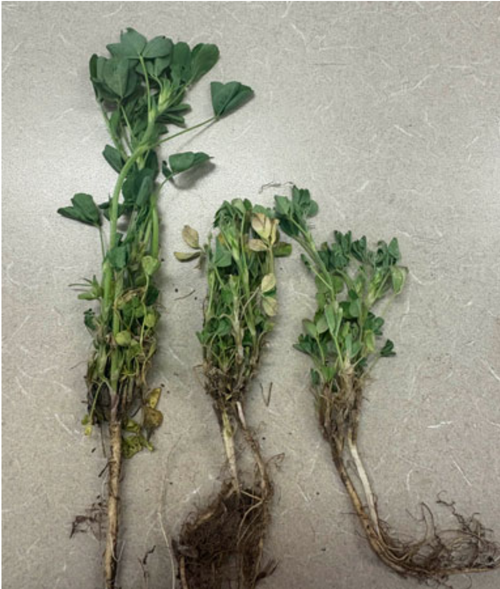
Figure 2. Healthy alfalfa plant (on the far left) with stunted plants from the same field.