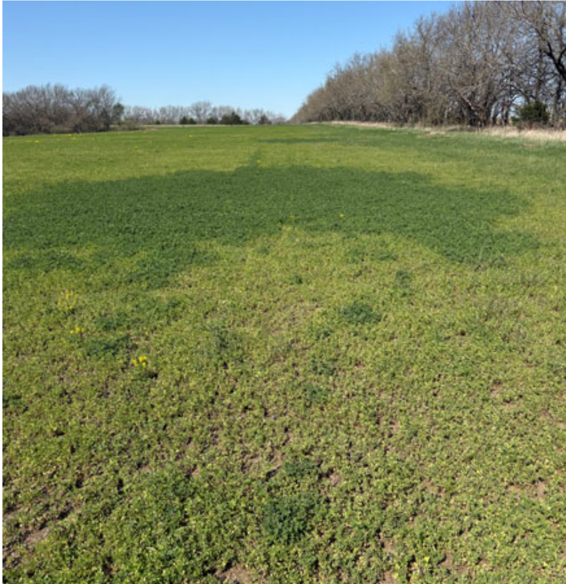
Figure 1. Alfalfa field showing yellowing areas with patches of green, healthy plants.

Several reports have been received of alfalfa stands, ranging from new seedings to established fields, not performing as expected. In many cases, symptoms are not uniform within the same field, with patches of healthy plants occurring alongside areas of poor growth (Figures 1 and 2). This article highlights common visual symptoms, what they may indicate, and potential management strategies.