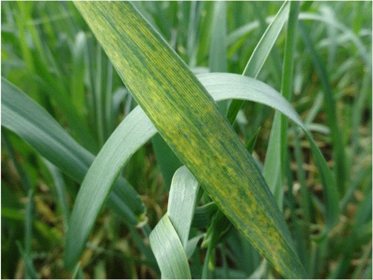
Figure 8. Typical symptoms of wheat streak mosaic virus.

Barley yellow dwarf. This viral disease is vectored by bird cherry oat aphids and greenbugs. Small or large patches of yellow plants will occur, typically around the boot stage (Figure 9). The leaf tip turns yellow or purple, but the midrib remains green. The yellowing caused by barley yellow dwarf is less botchy than the yellowing caused by other viral diseases. Plants infected by barley yellow dwarf are often stunted.