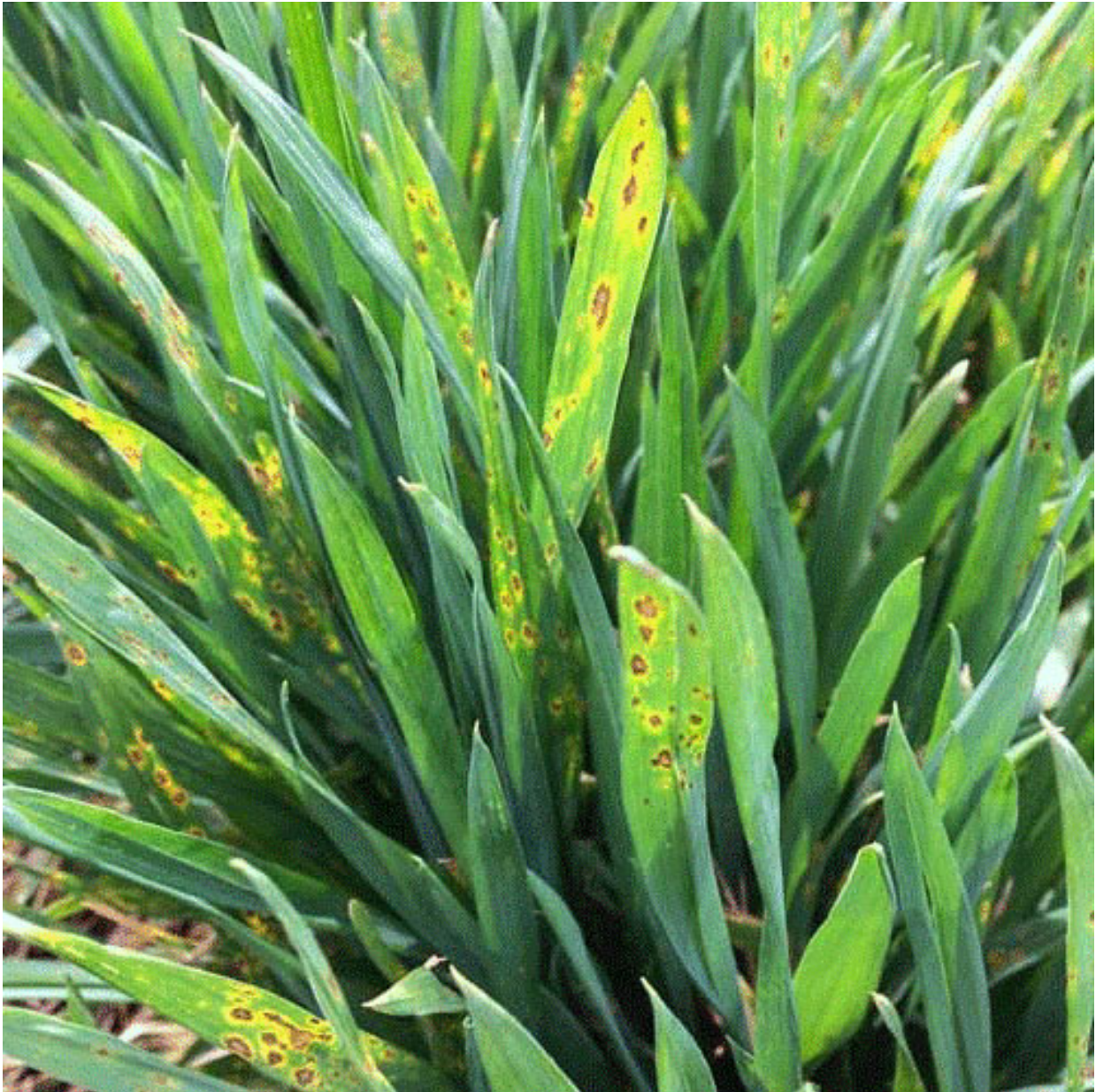
Figure 6. Stagonospora nodorum leaf blotch symptoms in the upper wheat canopy.

Soilborne mosaic or spindle streak mosaic. Soilborne mosaic and spindle streak mosaic (Figure 7) are viral diseases that occur primarily in eastern and central Kansas but are rare in western Kansas. These diseases are most common in years with a wet fall followed by a cool, wet spring. These diseases are often most severe in low areas of the field where soil conditions favor infection. Symptoms are usually most pronounced in early spring, then fade as temperatures warm. Leaves will have a mosaic of green spots on a yellowish background. Infected plants are often stunted in growth. Many varieties in the eastern part of the state have high levels of resistance to these viral diseases.