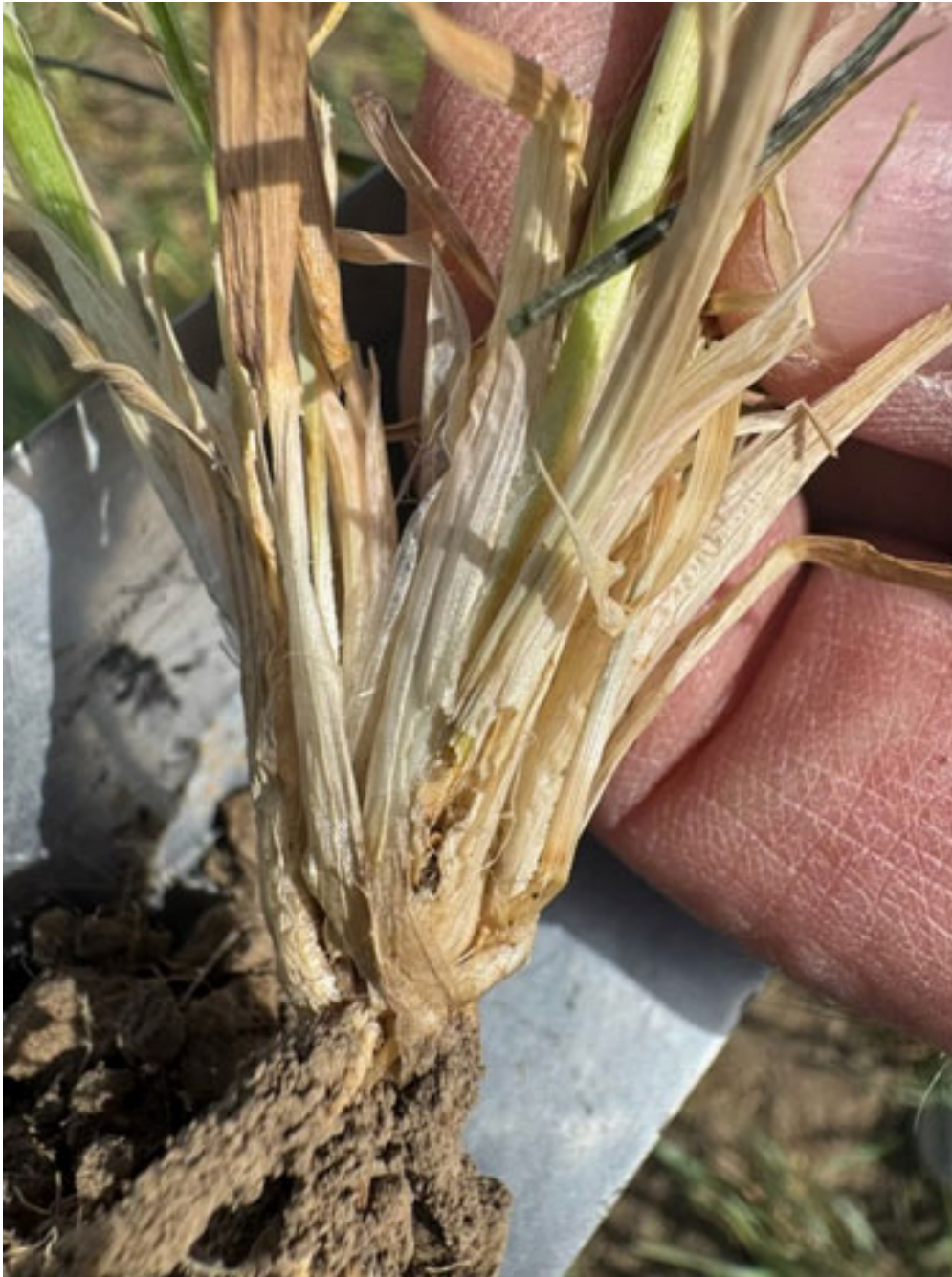
Figure 3. Note the damage to the base of the plant.