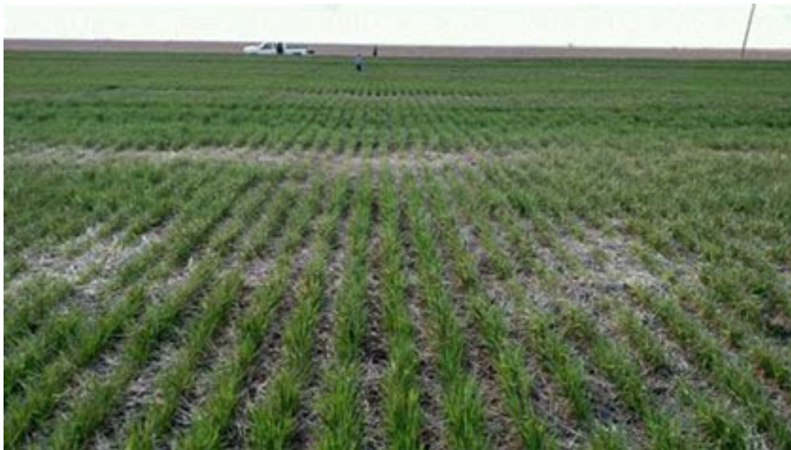
Figure 4. Effect of soil residue on wheat freeze damage. Wheat shows more damage from freezing temperatures in thicker residue layers.

While the extent of potential freeze damage depends on minimum temperatures achieved, duration of cold temperatures, and stage of wheat development, other factors such as crop residue, position on the landscape, wind speed, snow cover, and soil temperatures also play a role. Figure 4 shows an example of the effect of heavy residue on potential wheat damage. In this photo, parts of the field with a heavier layer of residue show greater cold damage than lighter residue. This can be partially explained because, under a thicker layer of residue, the wheat crown tends to form closer to the surface and, therefore, is more exposed to freezing temperatures.