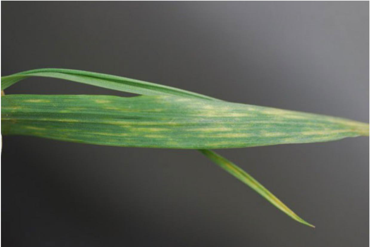
Figure 7. Wheat with symptoms of wheat spindle streak mosaic. Notice the yellow, linear lesions that are tapered at both ends.