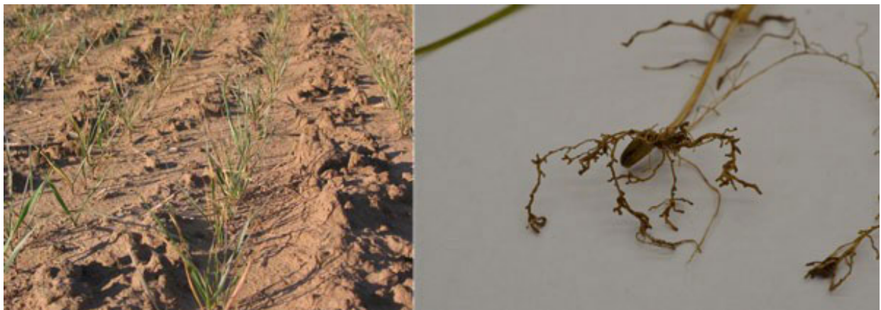
Figure 3. Wheat growing on very acidic soils, such as this soil in Harper County with a pH of 4.6, is often spindly and has poor vigor. Photos by Dorivar Ruiz Diaz, K-State Extension.

Typically, these symptoms become apparent in early spring and are exacerbated by drought, such as this spring. Although the wheat crop may recover from this condition with sufficient moisture, the impact on yields may already be evident. A corrective measure will require a lime application for the next crop.