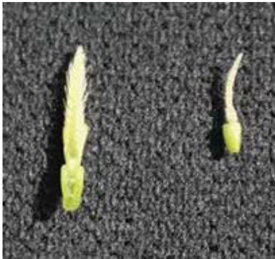
Figure 3. Comparison between a healthy developing wheat head (left-hand side, typically light green and firm) versus a developing wheat head that sustained freeze injury (right-hand side, whitish/brown and mushy).

While the extent of potential freeze damage depends on minimum temperatures achieved, duration of cold temperatures, and stage of wheat development, other factors such as crop residue, position on the landscape, wind speed, snow cover, and soil temperatures also play a role. Figure 4 shows an example of the effect of heavy residue on potential wheat damage. In this photo, parts of the field with a heavier layer of residue show greater cold damage than lighter residue. This can be partially explained because, under a thicker layer of residue, the wheat crown tends to form closer to the surface and, therefore, is more exposed to freezing temperatures.