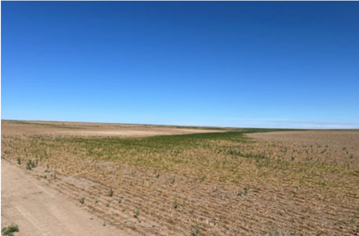
Figure 4. Wheat field impacted by pale western cutworm caterpillars.

Management of this pest is warranted when larvae average 2 or more per foot of row. Scouting will require digging up several inches of soil immediately along the rows. Chemical control of pale western cutworm is possible, but difficult. Larvae feeding below the surface may not be fully impacted by an application lacking in carrier volume. The typically drier conditions of the soil associated with these outbreaks can also make it difficult for the application to penetrate the soil profile.