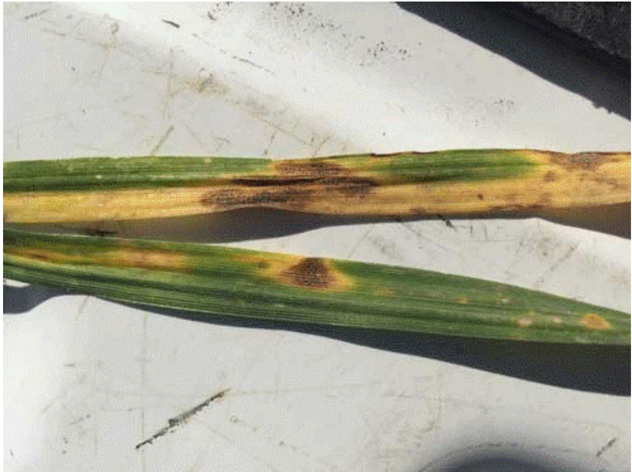
Figure 5. Septoria tritici blotch (leaf spot) colonizing tissue from the lower wheat canopy that was already senescing.

Leaf senescence and opportunistic leaf spotting diseases. After the winter, it is normal for some of the leaves in the lower canopy to go through senescence and perish, sometimes translocating nutrients to the new growth, and sometimes just due to different natural reasons. This causes the lower wheat canopy to yellow. Some opportunistic saprophytic fungi or fungal diseases, such as leaf spots ( Septoria tritici blotch, Stagonospora nodorum leaf blotch, and tan spot), may colonize these dying tissues, as shown in Figure 5. For the most part, in Kansas, these diseases do not cause economic damage as long as they remain on the lower leaves, especially if they occur in tissue already dying. They might become a problem and warrant a fungicide application in specific situations, such as when a susceptible variety is planted into heavy wheat residue – especially under no-tillage practices, and when symptoms appear in the upper canopy after the flag leaf has emerged (see Stagonospora nodorum leaf blotch, in Figure 6).