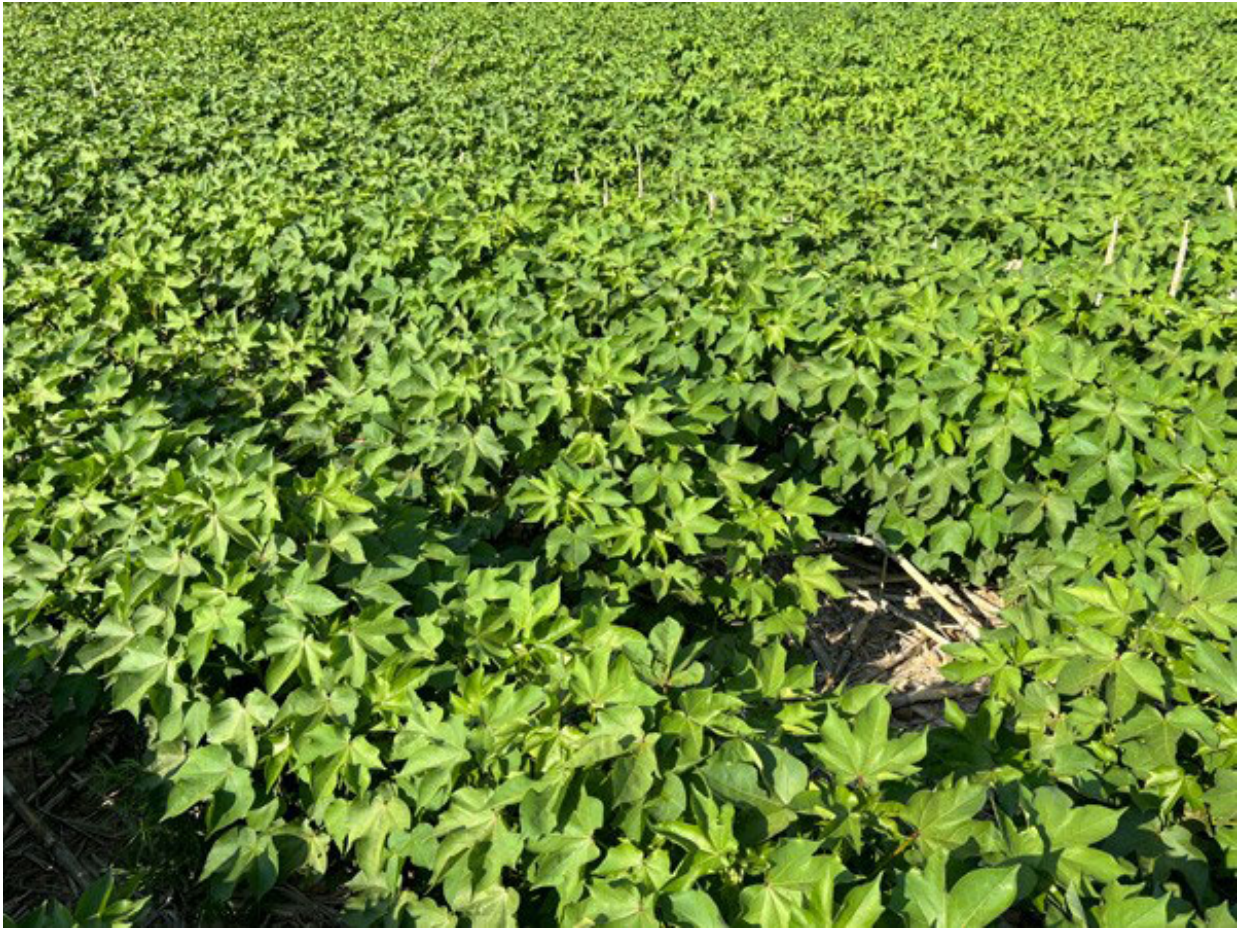
Figure 2. Residual herbicides applied post-emergence prevent late-season weed competition in cotton.

For more detailed information, see the “2026 Chemical Weed Control for Field Crops, Pastures, and Noncropland” guide at https://www.bookstore.ksre.ksu.edu/pubs/CHEMWEEEDGUIDE.pdf or check with your local K-State Research and Extension office for a paper copy.