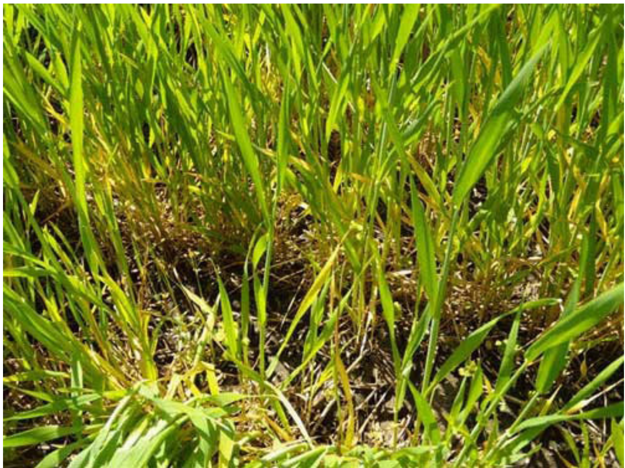
Figure 1. Nitrogen deficiency in wheat. The lower leaves are the first to become chlorotic (yellow).

Nitrogen deficiency. As the crop starts to grow in the spring, its nitrogen (N) demand increases. It is common to see N deficiency, especially when the temperatures are lower, and little N is mineralized from the soil organic matter. Nitrogen deficiency causes an overall yellowing of the plant, with the lower leaves yellowing and dying from the leaf tips inward (Figure 1). Nitrogen deficiency also reduces tillering, top growth, and root growth. The primary causes of N deficiency are insufficient fertilizer rates, application problems, applying the nitrogen too late, leaching from heavy rains, denitrification from saturated soils, and the presence of heavy amounts of crop residue, which immobilize nitrogen. Dry soils, such as most of the wheat-growing areas in Kansas this year, can limit crop N uptake. Therefore, it is not uncommon for nitrogen deficiency to occur together with drought stress symptoms.