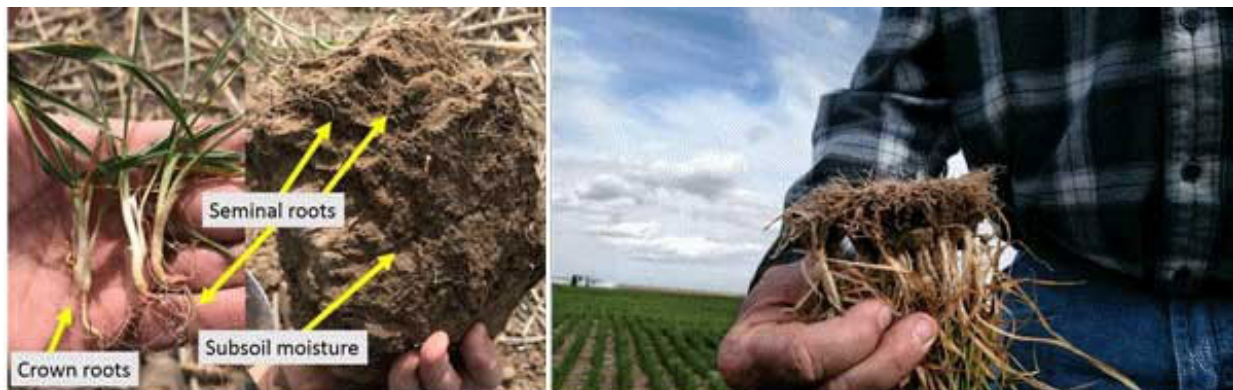
Figure 1. The left panel shows the lack of development of the crown rooting system of a wheat field due to drought conditions in the topsoil. The right panel shows a slightly more developed but also extremely shallow rooting system, likely due to a restrictive dry topsoil layer.

Poor root growth. Many potential causes exist for reduced root growth: dry soils, later sowing, waterlogging, or elevated crown height caused by shallow planting depth or excessive residue in the root zone (Figure 1). If the plants have a poor root system, their roots are not extensive enough to access sufficient water and nutrients, leading to yellowing.