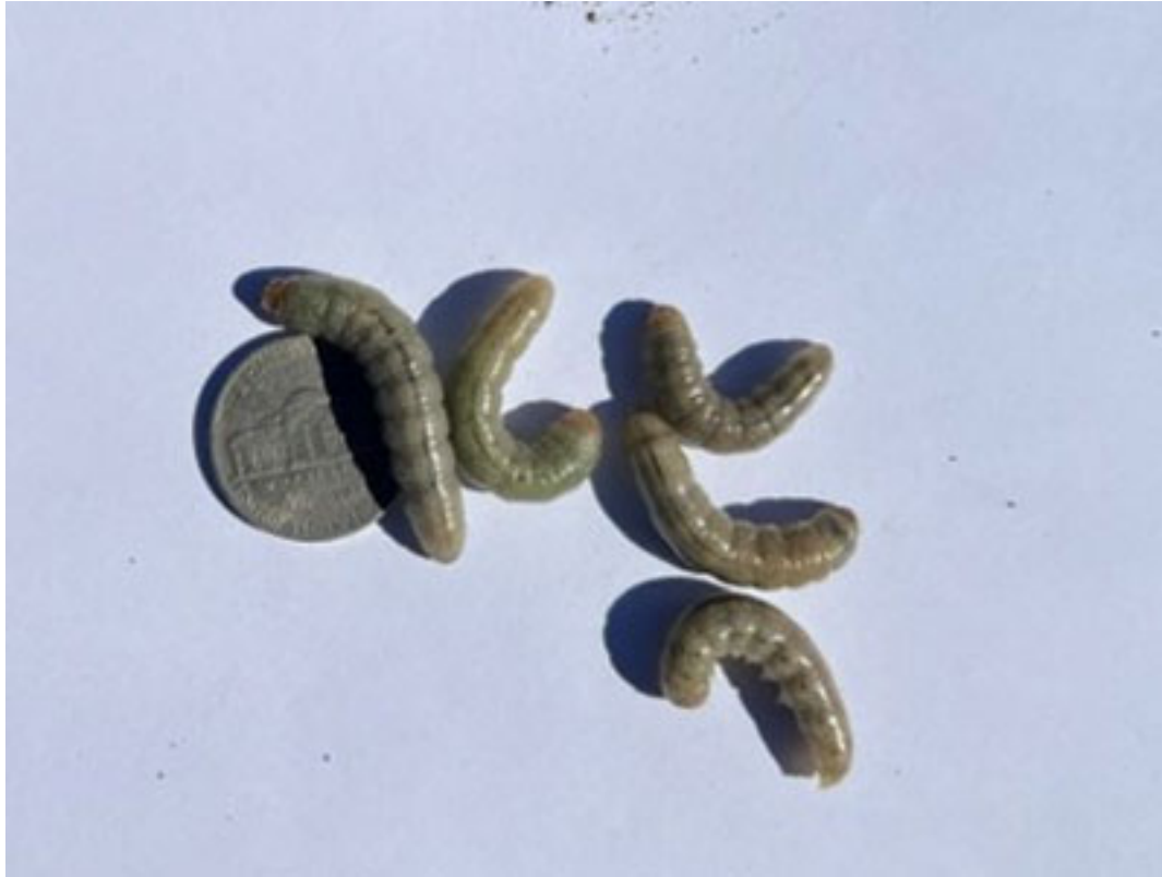
Figure 1. Pale western cutworm caterpillars found in a damaged wheat field.

Pale western cutworm ( Agrotis orthogonia ), an infrequent pest of wheat in western Kansas, has been active this spring. This pest benefits from drought conditions, and it appears that the drier weather pattern of the last few seasons has allowed populations to build up in some areas. Outbreaks of this caterpillar are usually sporadic and can occasionally cause highly localized, extreme damage. Suspected pale western cutworm damage was reported from fields in northwest Kansas in 2025, and this month, a wheat field in Wichita County suffered noticeable damage, and active pale western cutworm caterpillars were found (Figure 1).