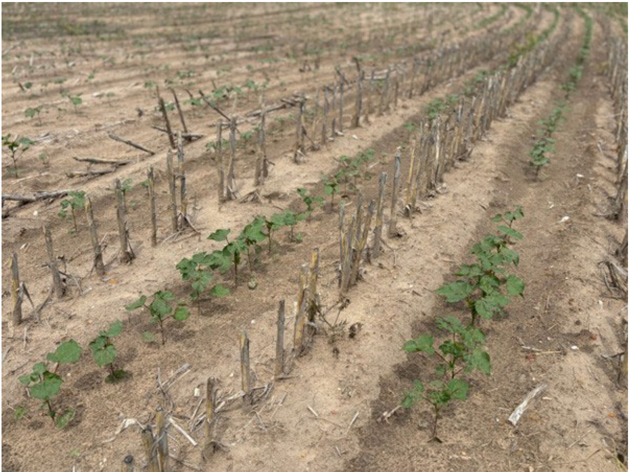
Figure 1. Residual herbicides applied at planting are needed to prevent early-season weed competition in cotton.

Early-season weed control is essential in cotton because it can be slow to canopy relative to other crops grown in Kansas and is, therefore, less competitive early in the growing season (Figure 1). Weeds compete with cotton for water, nutrients, and sunlight during the growing season and contribute to trash and discoloration of the lint at harvest, resulting in reduced quality grades and lint value.