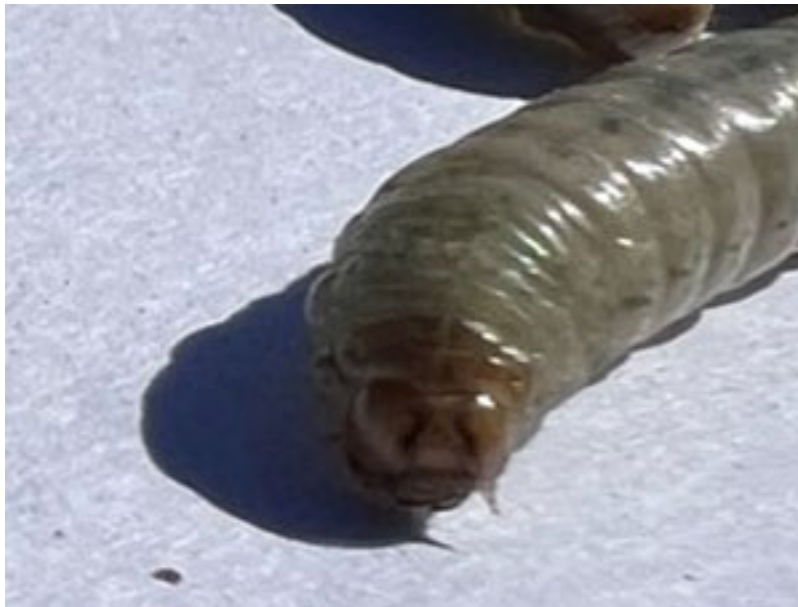
Figure 2. Note the brown head capsule and distinct vertical dark stripes on the face.

Pale western cutworms are a belowground pest and feed on stems, severing them just below soil level. Caterpillars can also bore into or out of the plants at their base near the soil level (Figure 3). Large areas of a field can be lost in just a few days under outbreak conditions (Figure 4).