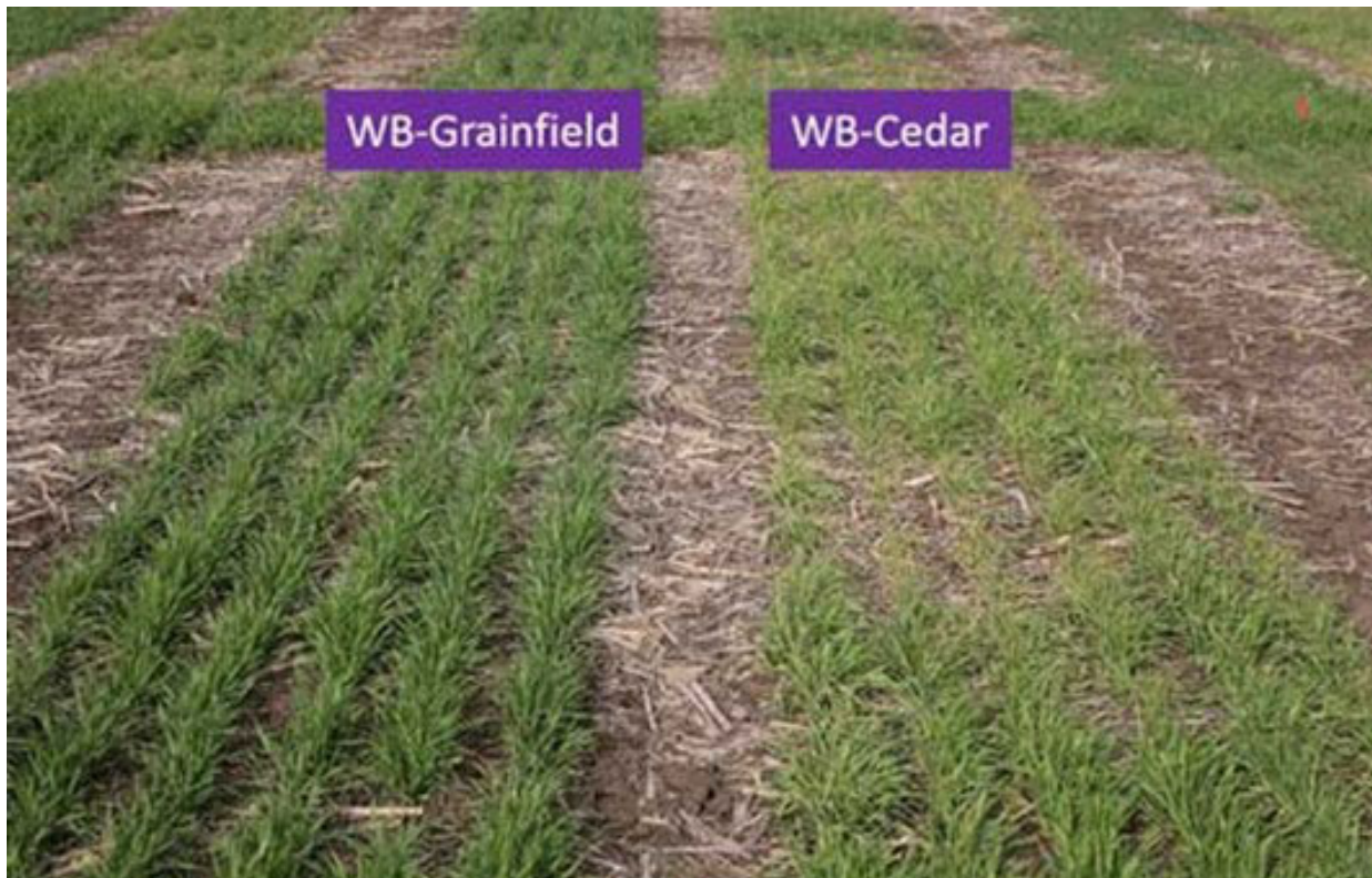
Figure 2. Yellowing wheat from cold weather injury at the tillering stage. The wheat variety on the left (WB-Grainfield) has a later release from winter dormancy than WB-Cedar (on the right). Thus, WB-Cedar sustained more leaf injury.

Freeze injury at the jointing stage. Jointing wheat usually tolerates temperatures in the mid- to upper 20s without significant injury. But, if temperatures fall into the low 20's or below for several hours, the lower stems, leaves, or developing heads can sustain injury (Figure 3). This could be the case this year due to the advanced crop development and the cold temperatures experienced in mid-March 2026. Producers are advised to scout their fields to assess yield potential 10-14 days after the freeze. If the leaves of tillers are yellowish when they emerge from the whorl, this indicates that those tillers have been damaged. More information on assessing wheat for signs of injury can be found in this recent eUpdate article: https://eupdate.agronomy.ksu.edu/article/wheat-status-injury-symptoms-from-freeze-damage-687-4 .