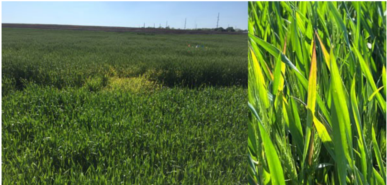
Figure 9. A typical patch of plants showing symptoms of barley yellow dwarf virus infection. as well as up-close symptoms of barley yellow dwarf

When in doubt, wheat samples can be submitted to the K-State plant disease diagnostic lab ( https://www.plantpath.k-state.edu/extension/plant-disease-diagnostic-lab/ ). As a reminder, good sample submission and fast shipping (not USPS) are keys to a good diagnosis. Any questions about sample submission can be directed to clinic@ksu.edu or 785-532-6176. More details about sample shipment can be found in this article: https://eupdate.agronomy.ksu.edu/article/k-state-plant-disease-diagnostic-laboratory-fee-adjustments-634-7 .